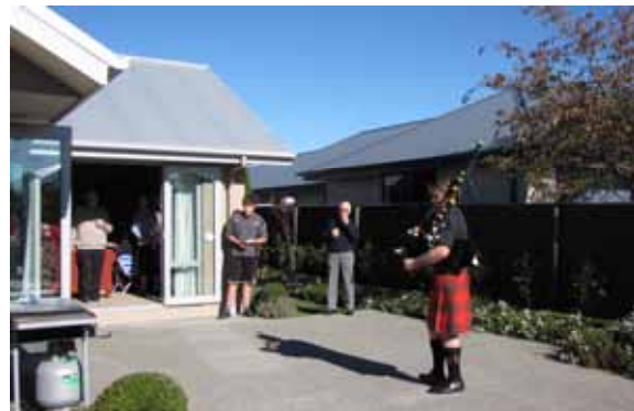
Blessing of the Vicarage at 11 Six Silvers Avenue.